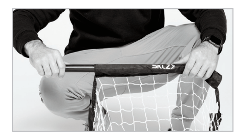
STEP 1: Take top frame pole (B) and slide through sleeve at top of net (A) where SKLZ logo is located.