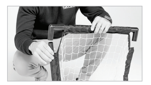
STEP 3: Slide left side pole (D) into net sleeve, and connect to top corner joint (E). Repeat on right side.